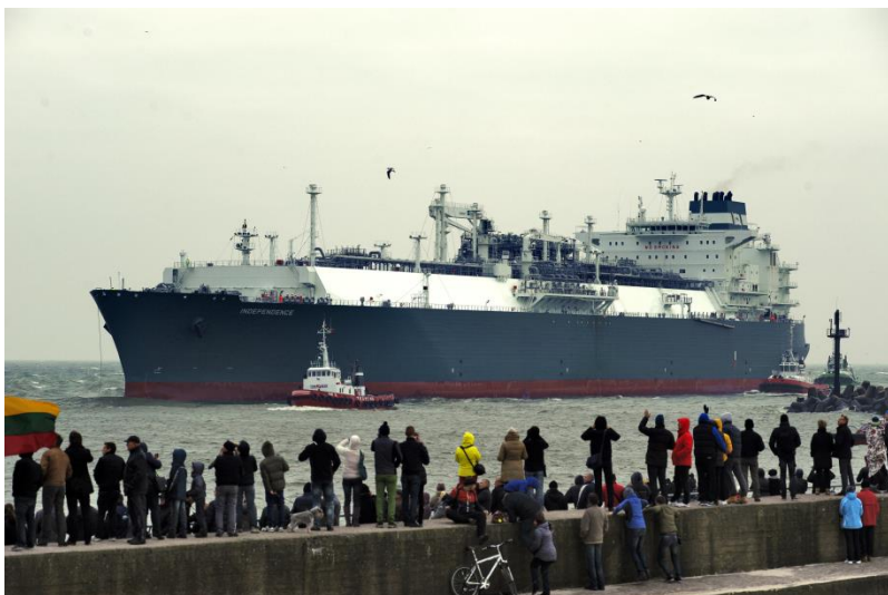
27 October Lithuania welcomes LNG carrier “Independence” at the port of Klaipėda.