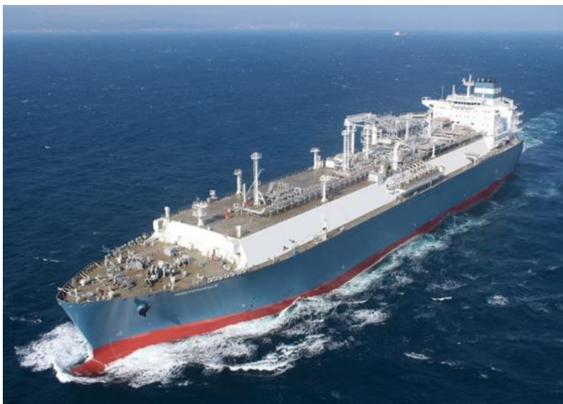
27 October Lithuania will welcome LNG carrier 'Independence' at the port of Klaipėda.