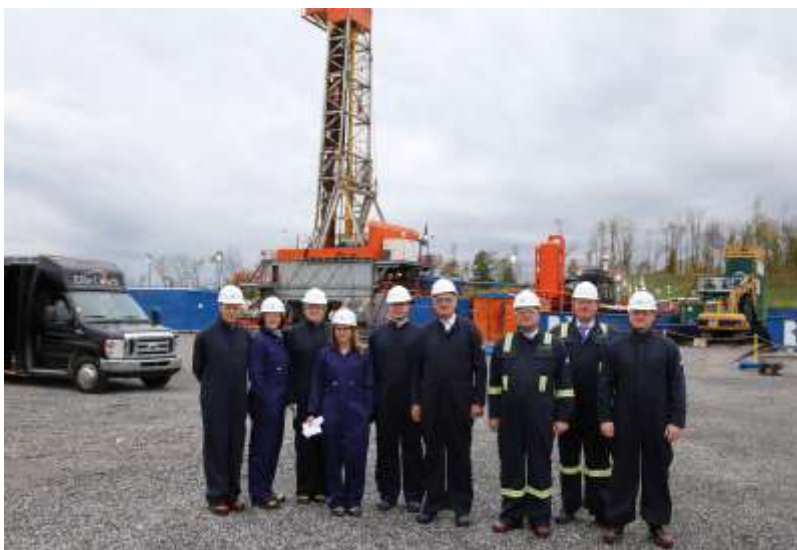
Prime Minister Algirdas Butkevičius at the Marcellus, Pennsylvania, shale deposit, which is one of the largest in the US.